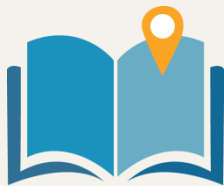
步走護照 Event Passport

步行路線沿途設有互動攤位，讓參加者可透過參與互動遊戲，親身了解及參與濕地保育工作，從而提高環境保育的意識。 Participants can understand more about our wetland conservation work through taking part in the interactive games and activities held along the route.