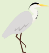
蒼鷺 Grey Heron