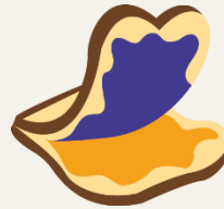
自備糧食 Light snacks

我們會為活動購買第三者保險， 參加者之個人保險須自行負責。 WWF will provide public liability insurance. Participants will be responsible for obtaining their own personal accident insurance.