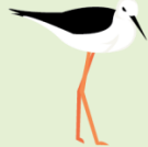
黑翅長腳鷸 Black-winged Stilt