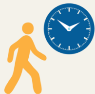
起步時段 Walking time slot

每天設十個起步時段供參加者選擇，起步時段由上午9時30分至下午2時，每30分鐘為一個時段。企業團體參加者可在報名時選擇一個起步時段。