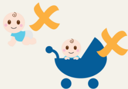
年齡限制 Age limit

There will be 10 time slots each day running consecutively at half hour intervals from 9:30 a.m. – 2 p.m. Group Participants can choose ONE time slot during the registration process.