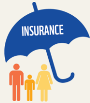
第三者保險 Third party insurance

我們會為活動購買第三者保險， 參加者之個人保險須自行負責。 WWF will provide public liability insurance. Participants will be responsible for obtaining their own personal accident insurance.