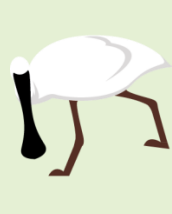
黑臉琵鷺 Black-faced Spoonbill