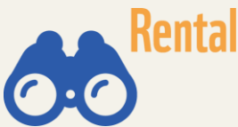
出租望遠鏡 Binoculars rental

途中多處設有洗手間、坐椅、飲水機和急救站等設備，照顧參加者所需。 Facilities such as toilets, water dispensers and benches are located along the route. First aid station is also provided.